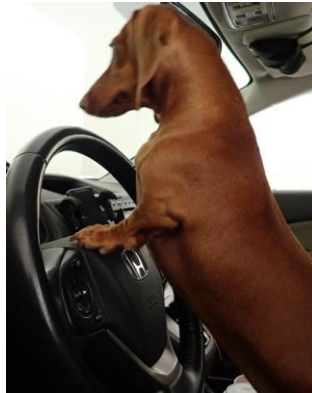
Heidi Sez: Be careful in your travels this summer

Saturday, June 2: VIP pancake breakfast at Wildwood Metropark from 8 to 11am. There is a fee of $5.00 Saturday, June 2. Bark in the Park at Side Cut Metropark from 9am to 1pm. Pet friendly activities.